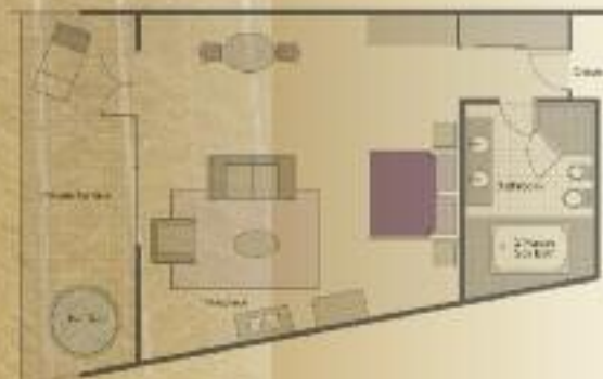
Medway Spa Suite: 80 sqm